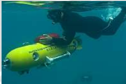
The UW work resides in these yellow "fish."